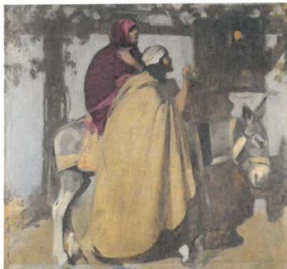
Arthur Melville (1855-1904) - Christmas Eve, 'And There Was No Room for Them in the Inn'

Las Posadas can help us retell the story of our own sojourns to new life. It can remind us of those who continue to cross geographic borders, psychological barriers, social boundaries, and spiritual barriers in search of newness of life, justice, and safety. But by God's incarnational grace, we are welcomed, and in turn, we are called to welcome others who may knock at our "doors."